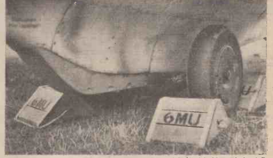
A close-up of the retracted landing-skid and jettisonable take-off chassis of the Messerschmitt 163B.

The machine had an all-up weight of 11,340lb., which was reduced to 4,640lb. by